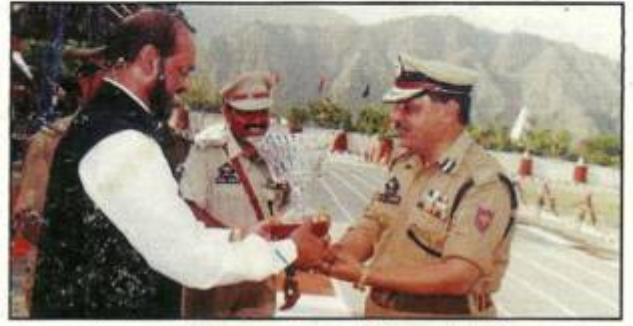
۲۸ مئی ۲۰۰۶ء کو ڈی جی پولیس ترقی مرکز تھوڑا (ریاستی) میں منعقدہ پانگ آؤٹ پر ٹیبلٹ موقعہ پر ریاستی پولیس کے سربراہ مرکزی وزیر مملکت برائے ریلوے کو یادگاری تحفہ پیش کرتے ہوئے۔