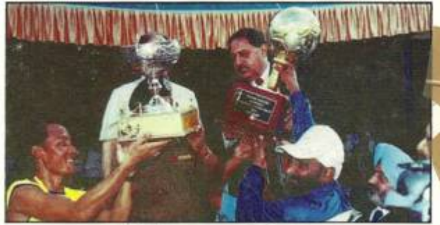
۳۰ جون ۲۰۰۶ء کو سر جگن ناتھ میں منعقدہ نوٹس پولیس شہداء یادگاری ٹسٹ بال ٹورنامنٹ ۲۰۰۶ء کی اختتامی تقریب پر افاضیوں کو تحفہ پیش کرتے ہوئے۔