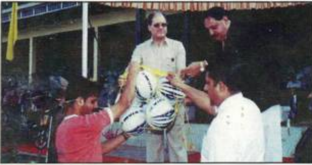
۳۰ جون ۲۰۰۶ء کو نوٹس پولیس شہداء یادگاری ٹسٹ بال ٹورنامنٹ کی اختتامی تقریب پر جموں و کشمیر کے قیامی کھیل کھتر برائے امور داغدا کھلاڑیوں میں تحفہ جات تقسیم کرتے ہوئے۔