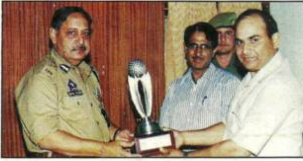
۲۸ مئی ۲۰۰۶ء کو ڈی جی پولیس ترقی مرکز تھوڑا (ریاستی) میں منعقدہ پانگ آؤٹ پر ٹیبلٹ موقعہ پر ریاستی پولیس کے سربراہ مرکزی وزیر مملکت برائے ریلوے کو یادگاری تحفہ پیش کرتے ہوئے۔